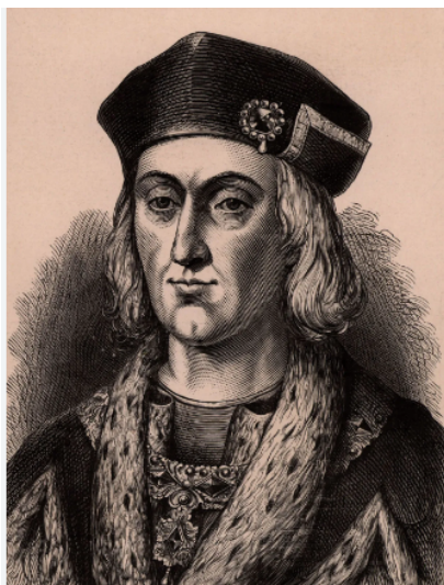
Cardinal John Morton

The Morton's Fork Coup is used to describe a play where, like the victims of Henry VII's Lord Chancellor Cardinal Morton, whatever the defender does is wrong.